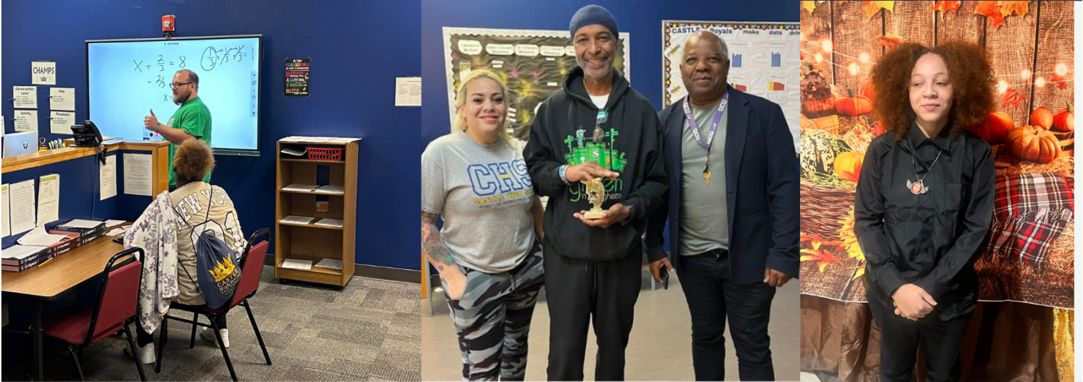
PHOTOS FROM AROUND CAMPUS